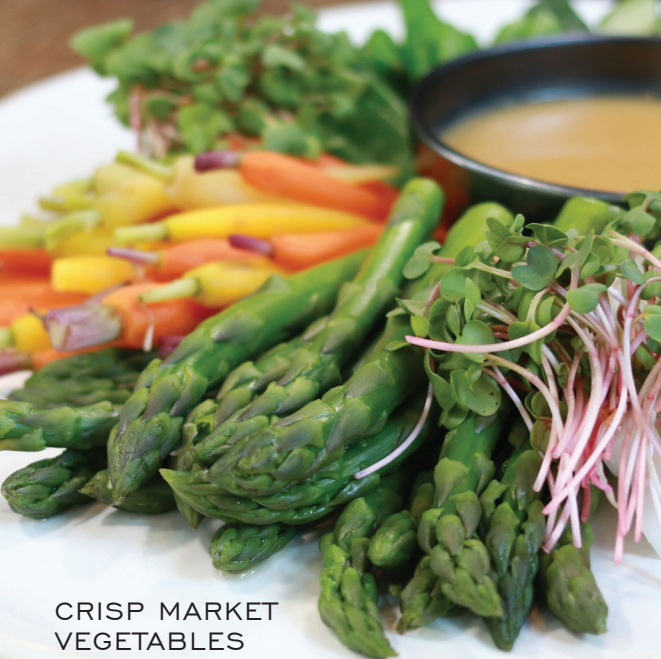
CRISP MARKET VEGETABLES