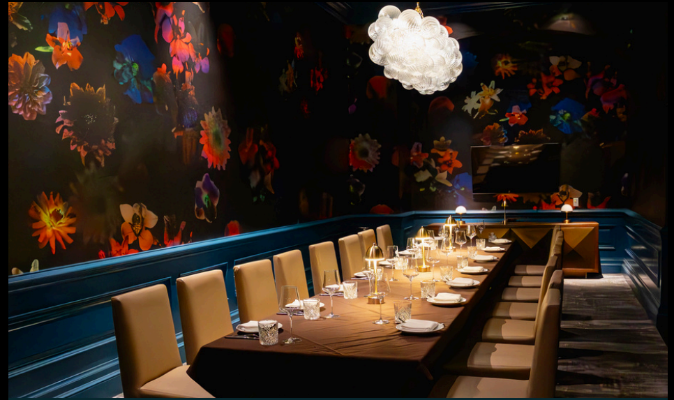
BLACK & BLUE PRIVATE ROOM