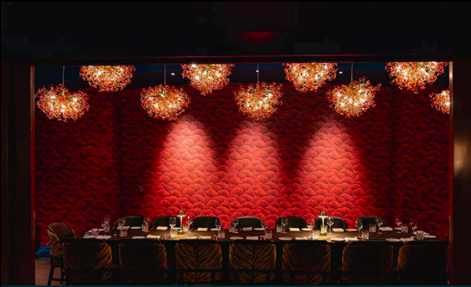
CRIMSON BARREL PRIVATE ROOM