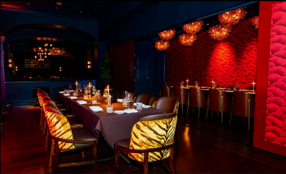
CRIMSON BARREL + WHISKEY ROW