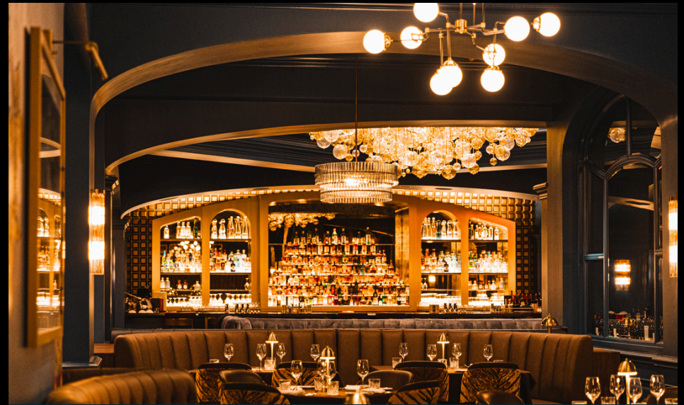
FULL RESTAURANT BUY-OUT