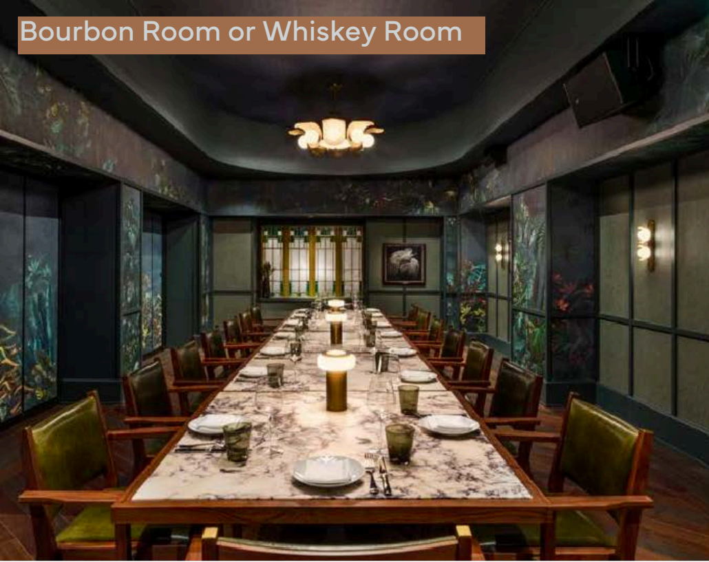
Bourbon Room or Whiskey Room